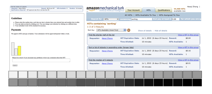
Figure 2. Snapshot of TurkSort, showing a pivot task [left], the Mechanical Turk page listing the sorting subroutines available to workers [right], and a (mostly correct) sorted list of tiles by grayscale [bottom].

To highlight opportunities within the first two subareas, we shall focus on examples drawn from classic computational problems studied in algorithms and AI, which, by being welldefined and well-studied, help to illustrate methods for engaging a crowd to perform more general computational solution procedures. For the third subarea, we describe an example of how humans can help break down a goal into a plan of execution.