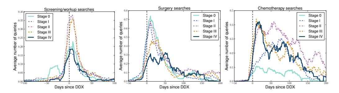
Fig. 3. Average number of queries per day by users associated (based on most frequent search) for each cancer stage. Patterns are consistent with cancer patients with these stages, e.g., surgery is not standard treatment for stage IV and chemotherapy is not standard treatment for stage 0 [Morrow and Harris 2000].

7.2.1. Multi-Pivot Histories. Figure 2 highlights a number of interesting patterns about search behavior over multiple episodes of breast cancer. We note that the overall search volume, including all other queries (beyond those captured by the ontology), remains relatively flat outside of the spikes at the pivots: this suggests that cancer-related search cuts into other search activity, and is indeed "disruptive," from the standpoint of search and retrieval performed prior to the illness. Cancer-related search is largely non-existent prior to the initial workup, but very heavy after the DDX. Cancer-related searches are 3.89 times more frequent in the 60-90 days after DDX than the 60-90 days before DDX, during which cancer searches are at baseline levels. Comparing the 30-day window beginning at 300 days after DDX, cancer-related searches are still 1.25 times greater than baseline levels. The non-ontology queries drop in frequency in these two periods after, at only .88 and .79 the baseline levels after 60-90 and 300-330 days.