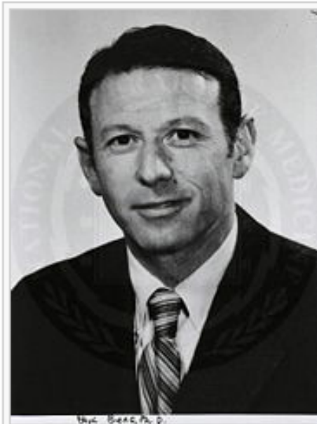
Paul Berg, a leading researcher in the field of recombinant DNA technology who subsequently shared the 1980 Nobel Prize in Chemistry with Walter Gilbert and Frederick Sanger .

The repercussions of these actions are still being felt through the biotechnology industry and the participation of the general public in scientific discourse. [3] Due to potential safety hazards, scientists worldwide had halted experiments using recombinant DNA technology, which entailed combining DNAs from different organisms [2][3] . After the establishment of the guidelines during the conference, scientists continued with their research, which increased fundamental knowledge about biology and the public's interest in biomedical research . [4]